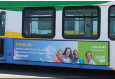
Once again, we thank you, MultiCare!

Since the 1990’s, Pierce Transit and MultiCare Health System (MHS) have been partnering to contribute to Pierce County’s vibrant and growing community. In 2016, the partnership took a giant leap forward as MultiCare leaders strengthened their pledge to alternative transportation options by making ORCA Passport, a pass that can be used for unlimited travel on six regional transit agencies, available to all 10,000 of their employees!